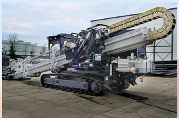
Nested Gortrac SRC Series carriers protect and guide hoses on this horizontal directional drilling machine by Universal HDD™.